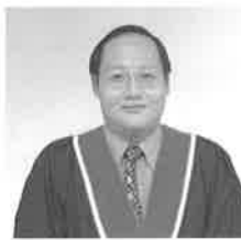
Dr Tan See Leng Council member