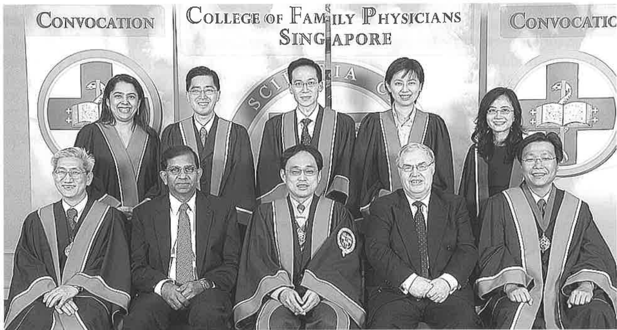
New fellows and College council members