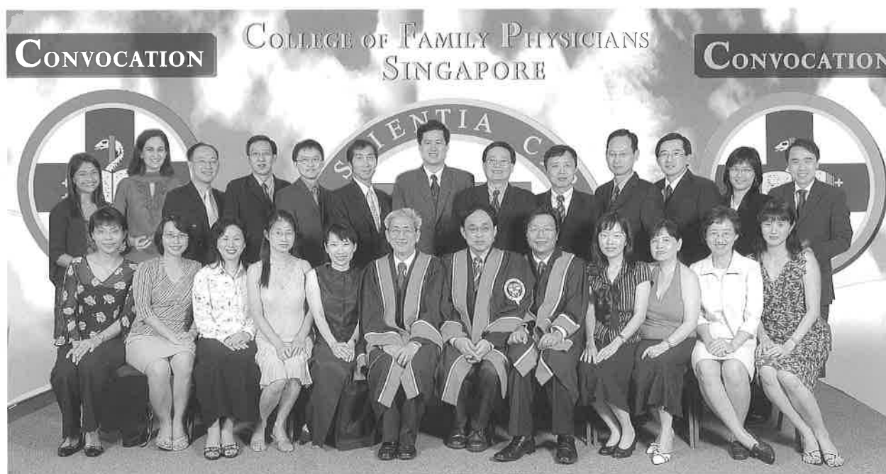
GDFM graduands and College council members